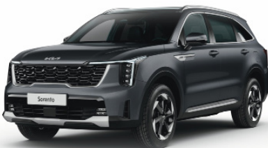
Interstellar Grey (AGT)