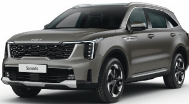
Volcanic Sand (BN4)