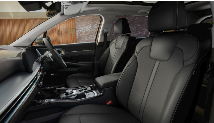
Black Vegan Leather