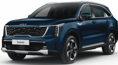
Gravity Blue (B4U)