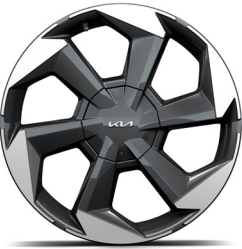
19" alloy wheels