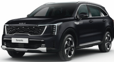
Aurora Black Pearl (ABP)