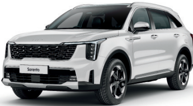
Snow White Pearl (SWP)