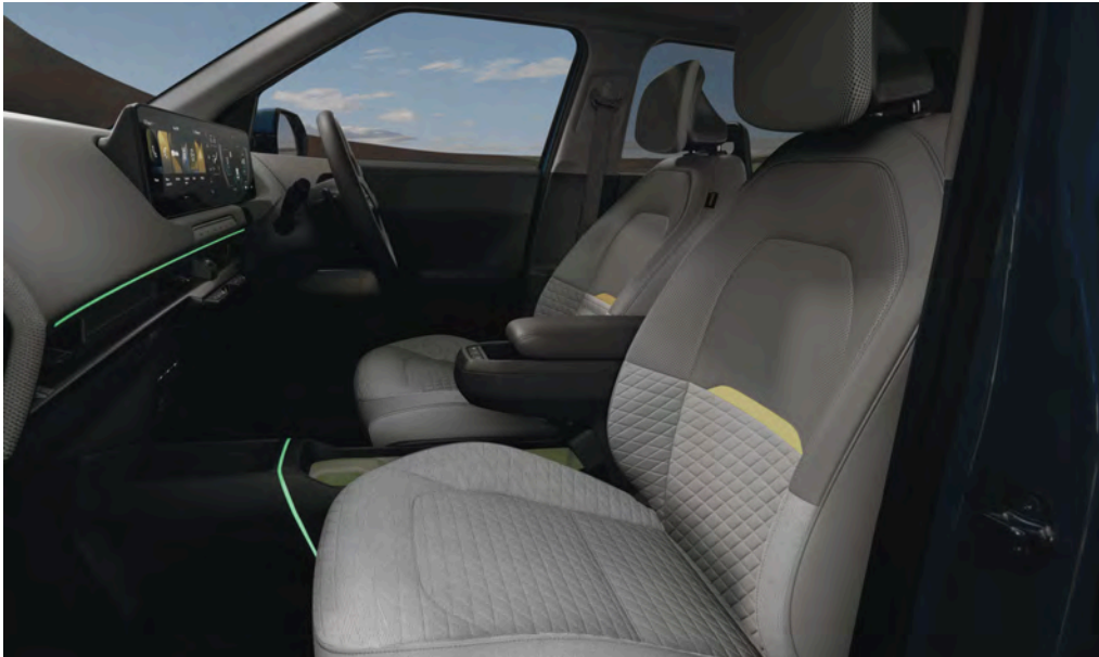
Cloth & Vegan Leather Seats