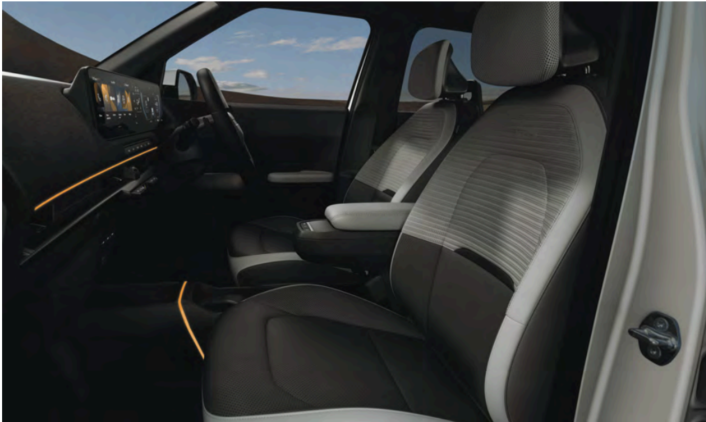
Vegan Leather Seats